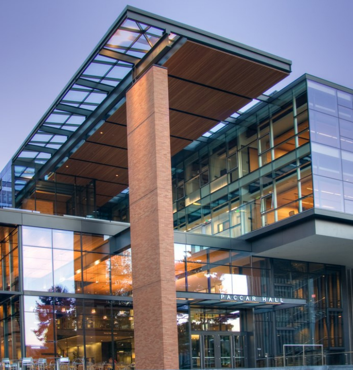
The University of Washington Foster School of Business: home to ACAP Seattle's Summer Residency Week Program